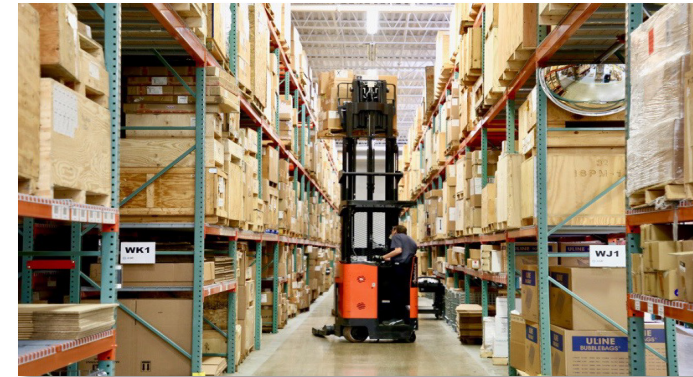
New multi-year distribution agreement with TRIUMPH to supply its actuation product line to commercial airlines and MROs commencing in FY2026

Supply tightness in USM with relief as aircraft retirements increase