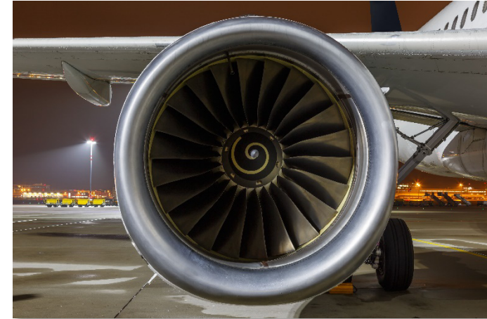
Announced multi-year contract extension and expansion with Sumitomo Precision Products to distribute its V2500 starter and valve components